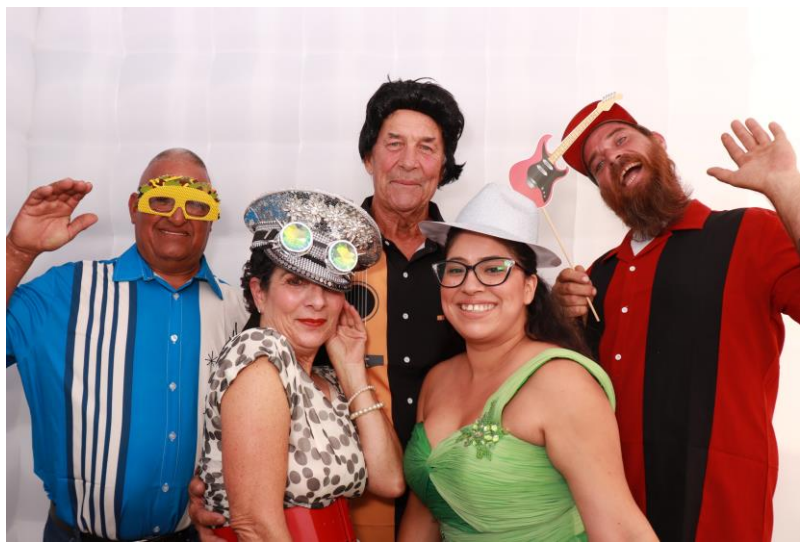
Costume change at the end of the night