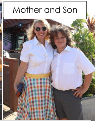
Mother and Son