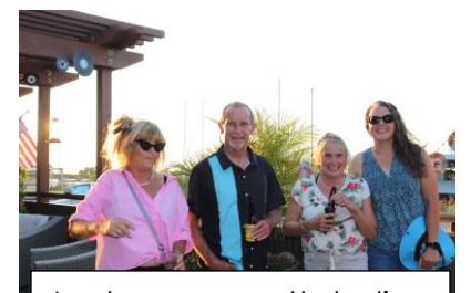
Lucky guy – pretty ladies