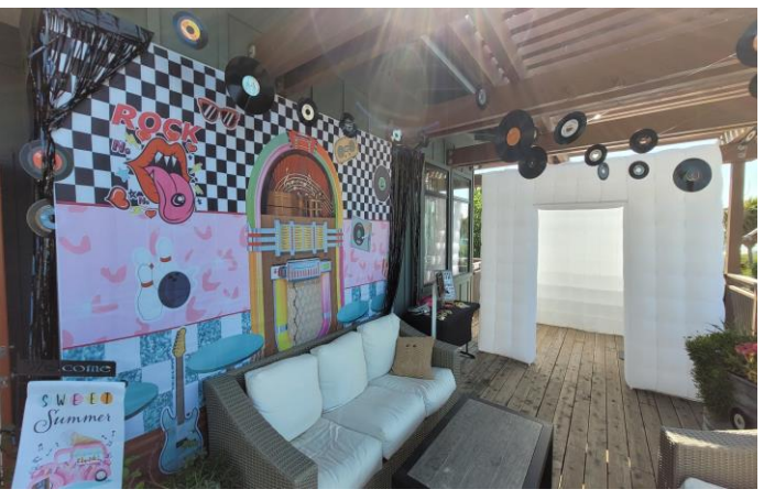
Step into the Owl Harbor Marina "Whoo Hop" party area. Photobooth and lounging, with maybe a cocktail or two.

"You only live once, but if you do it right, once is enough." — Mae West