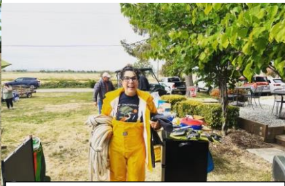
Hope it's a while before I need these foulies!!