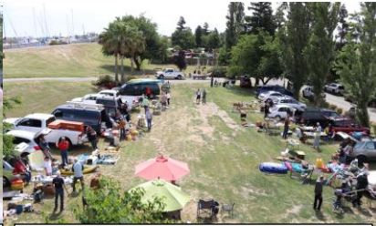
Full House and great things!