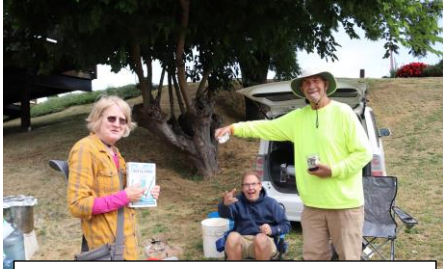
Very excited Trio – not sure over what, but having fun doing it.