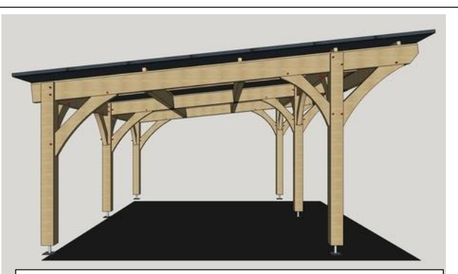
Large Carport Space Coming Soon If you are interested in this space, it is located down by our water tank area.

We are very excited to share that we are now the proud owners of an ice cream machine. We will be sharing this experience at the party on the 5<sup>th</sup>, enjoy!